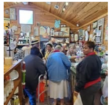
Seniors enjoying the annual Pre-Thanksgiving luncheon at the Life Church in Many!