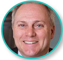
Steve Scalise District 1 57.3%