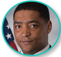
Cedric Richmond District 2 52.1%