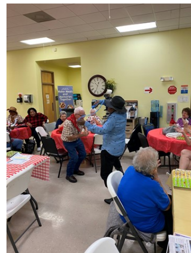
Wild, Wild West Celebration!