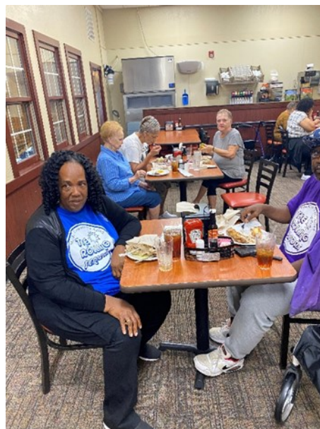
Seniors enjoying lunch at Golden Corral!