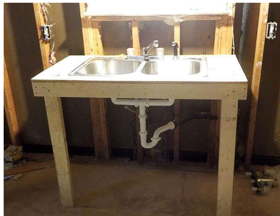
The kitchen sink is framed in and missing cabinets but functional.