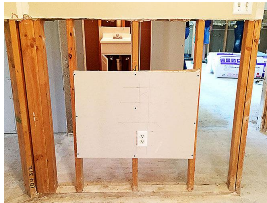
The contractor will make sure the electrical system is safe and working. This patch of drywall with the electrical outlet is temporary but functional.